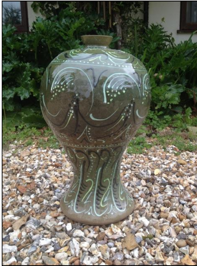
Influenced by a Chinese sung dynasty vase – always wanted one, so had a go.

A couple of months ago I found myself back in my old art college in Farnham, escorting my youngest daughter to her interview for an animation degree. Of course I couldn't resist a look round my old haunts The Ceramics Department! No longer are the rooms crowded with Leach Wheels, the Glazing Room and the Wet Store – gone. The Hand-building room is now a Design Studio, it made me consider the changes in ceramics over the years and why I had taken the decision to give up the galleries, exhibitions, table top sales and craft events in order to produce work just for myself.