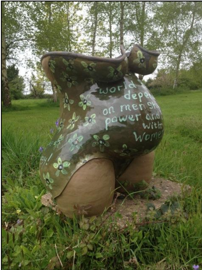
Coiled figure Equality

Ps My daughter was offered a place – she’s accepted.