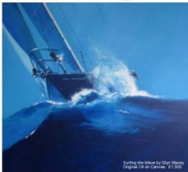
Sailing the Wave by Glyn Macey Original Oil on Canvas £1,500