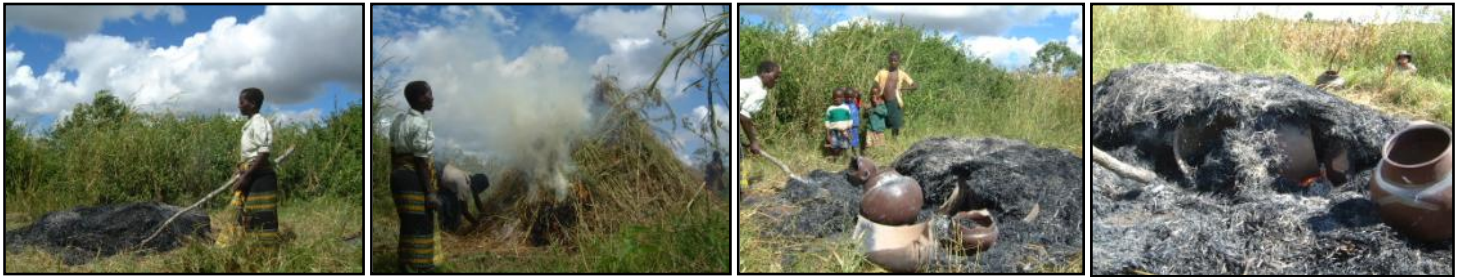
Figures 12-15 : Adding small sticks and dried grass and lighting the pile.