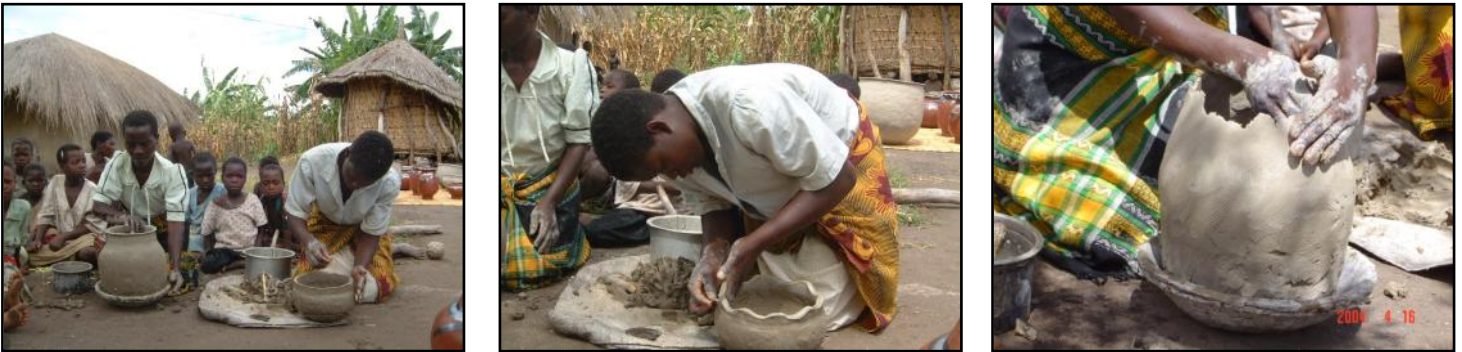
Figures 1-3 : Making pots from clay dug locally from near the river. Usually an old mango stone is used to help shape the clay.

In Malawi it is the women that make the pots and the men that do the selling. The different shapes and sizes are sold in the markets, each having a different function. Often whole villages or groups of villages are involved in making pottery. The pictures below were taken at a firing day in the village of Nkoma.