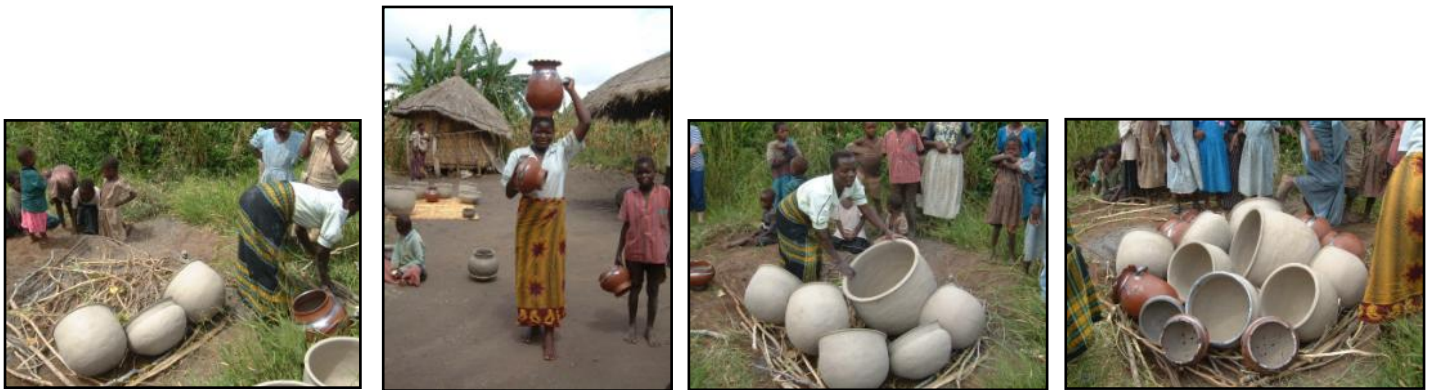
Figures 4-7 : Carrying the dried pots to the firing area and placing them in a small hollow on a bed of kindling.